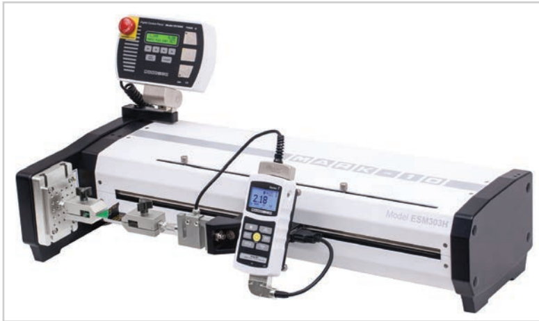
^ ESM303H is shown above configured for a peel test, with a Model M7i indicator, Series R01 load cell, and G1008 film and paper grips.

The ESM303H is a highly configurable horizontal force tester for tension and compression measurement applications up to 300 lbF [1.5 kN], with a rugged design suitable for laboratory and production environments. Sample setup and fine positioning are a breeze with available FollowMe™ force-based positioning - using your hand as your guide, push and pull on the load cell to move the crosshead at a variable rate of speed.