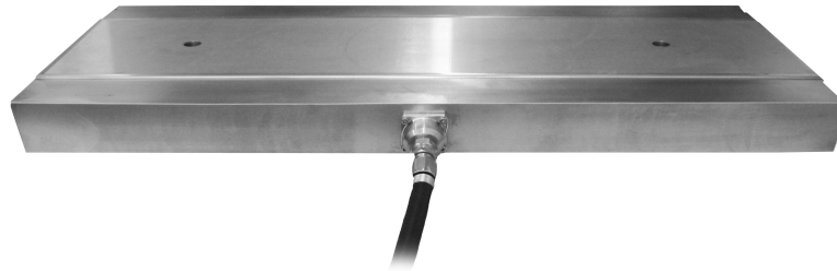
ROLLMAX SLAB LOAD CELL