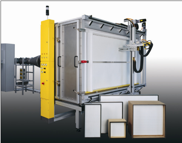
Automatic Filter Scanner AFS 150