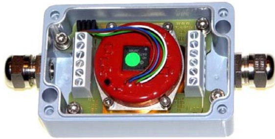
Sensor box containing one NG360 inclinometer with RS485 interface