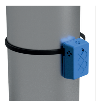
Sensors with IP21 Enclosure

Keep antenna clear off the metallic surface