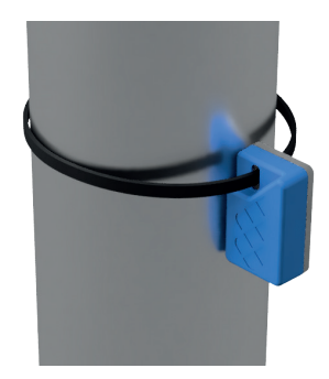
Sensors with IP67 Enclosure