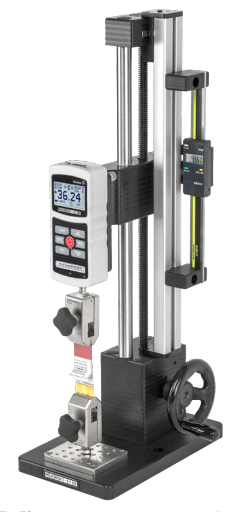
The ES30 is shown in a typical peel testing application, with Series 5 digital force gauge, digital travel display, and film & paper grips.