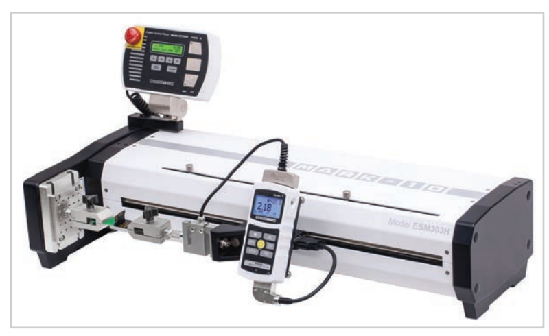
^ ESM303H is shown above configured for a peel test, with a Model M7i indicator, Series R01 load cell, and G1008 film and paper grips.