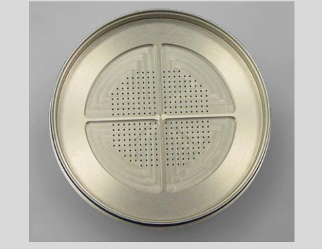
Figure 2. Nozzle pattern for Stage 3

Multiple nozzles at each stage provide flow conditions that result in sharp-cut size characteristics (Figure 3) and low pressure drop.