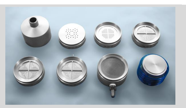
Figure 1. High-Flow impactor parts

The impactor is made of anodized aluminum to ensure dimensional stability of the nozzles with no oxidation build-up or corrosion and light in weight.