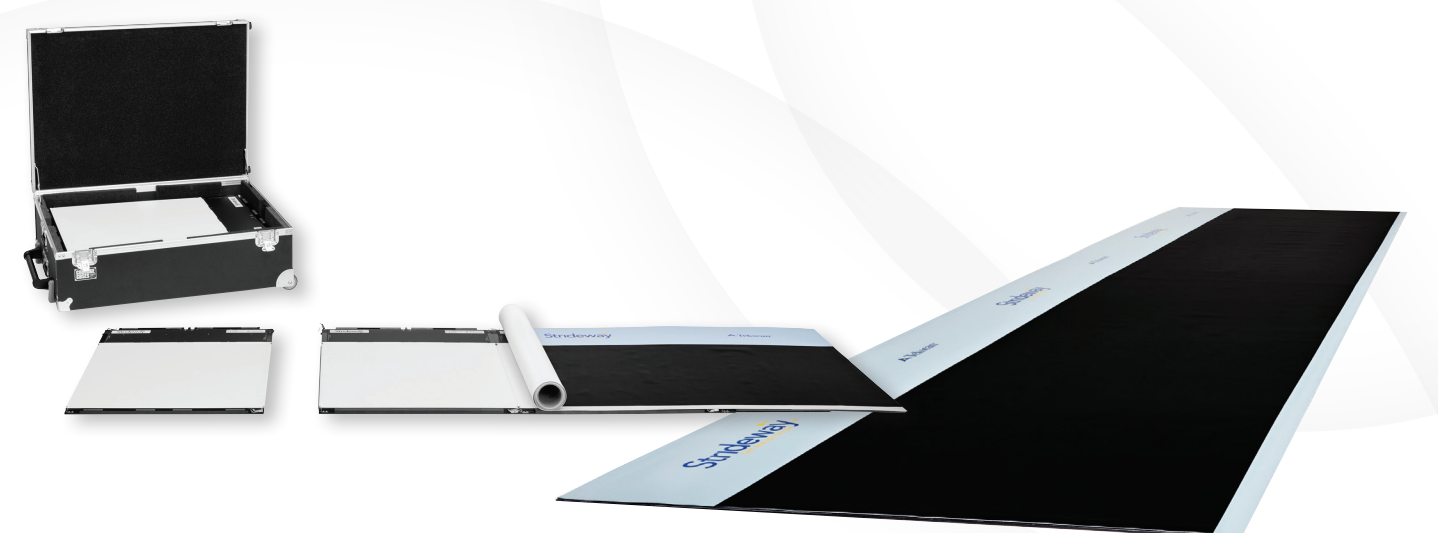
The Strideway is quickly assembled/dis-assembled for easy storage & transportation.

The Strideway system comes with a compact storage case on wheels for convenient storage and transport. It is quickly assembled and dis-assembled to provide complete flexibility with data collection. In addition to creating a truly portable form factor, the modular set-up means that additional tiles can be added on at any time to create a longer surface area.