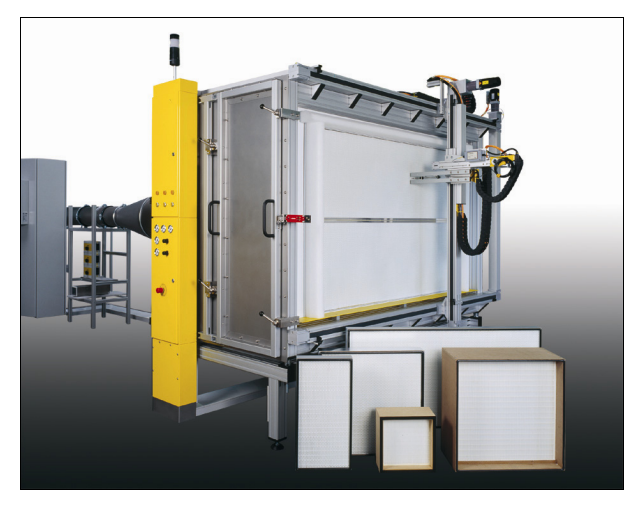
Automatic Filter Scanner AFS 150