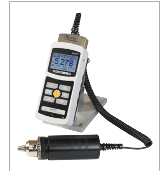
7i is shown mounted to an optional AC1008 tabletop stand with Series R50 torque sensor

The 7i interfaces with Mark-10 test stands to permit functions such as break testing, dynamic load holding, PC control capability, and more. The included MESUR™ Lite data acquisition software tabulates continuous or single point data. Data saved in the indicator's memory can also be downloaded in bulk. One-click export to Excel easily allows for further data manipulation.