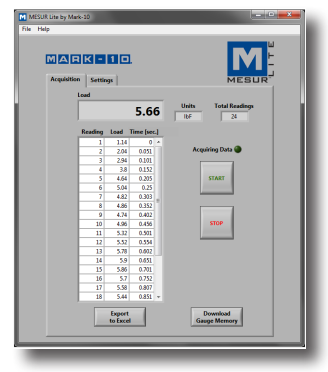
MESUR™ Lite data acquisition software is included with the 7i

enhancement, the indicator also features automatic data output, data storage,