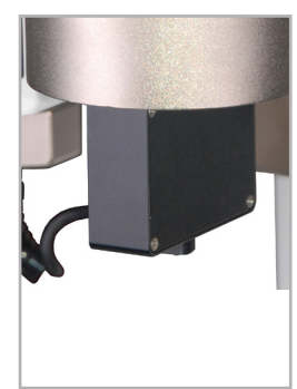
^ Series R03 sensor with shortened cable is shown mounted to an ESM1500LC test stand *