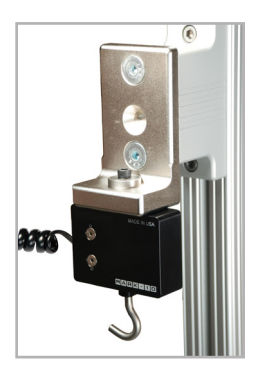
^ Optional AC1018 mounting kit adapts a Series R03 sensor to a Mark-10 test stand.