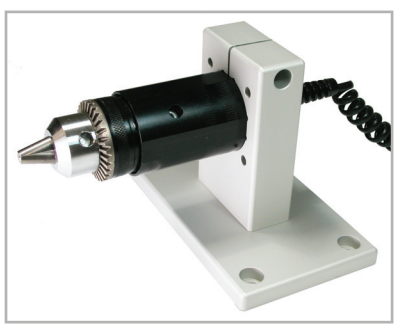
^ Optional AC1007 tabletop mounting kit may be used to hold the sensor in place.

< The Plug & Test™ connector locks into the receptacle in the indicator when fully inserted. Dual buttons on the indicator housing release the connector for easy removal. Gold plated spring contacts ensure long lasting and reliable connection.</p>