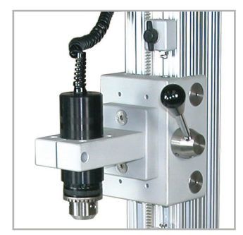
^ A Series R50 torque sensor is shown mounted to a model TSTM motorized torque test stand. The sensor fits into the stand without the need for additional adapters.