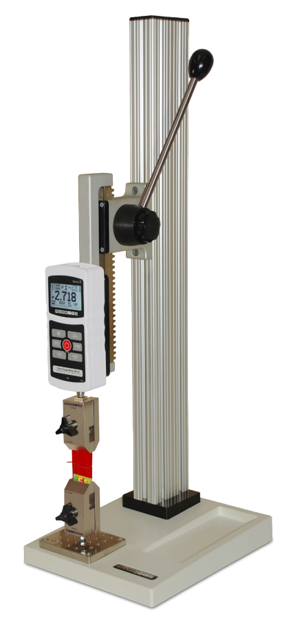
The TSB100 is shown with a Series 5 force gauge