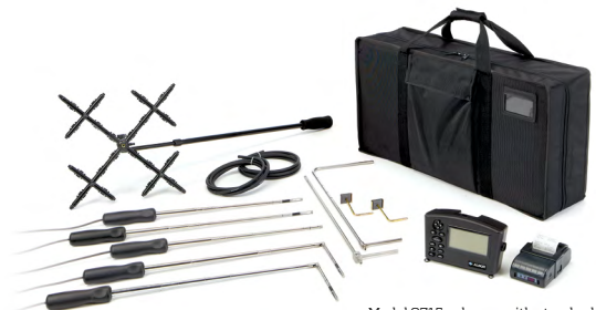
Model 8715 - shown with standard and optional accessories