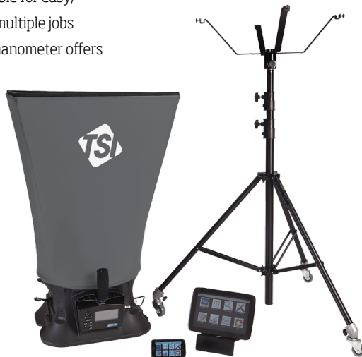
Model 8380 - shown with standard and optional accessories