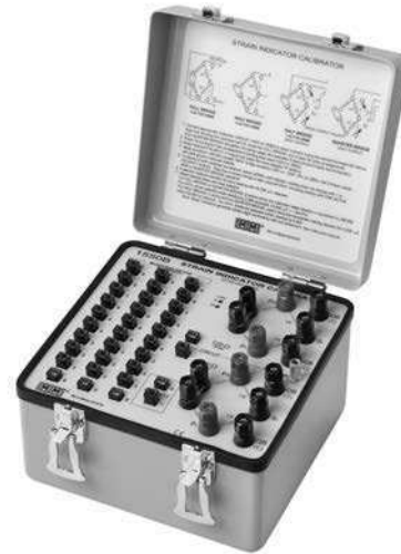
A laboratory standard for verifying the calibration of strain and transducer indicators.