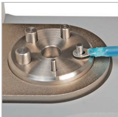
WT3002 Ring terminal fixture

Secures ring terminations. Pin diameters from 1/8 to 3/8 in [3.2 to 9.5 mm].