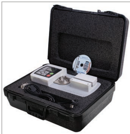
WT3004-1 Carrying case

Provides storage space for the WT3-201M tester, optional ring terminal fixture, power cord, USB cable, and accessories.