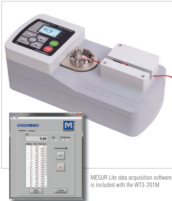
MESUR Lite data acquisition software is included with the WT3-201M

The WT3-201M motorized wire crimp pull tester is designed to measure pull-off forces of up to 200 lbF [1 kN] for wire and tube terminations. The tester conforms to numerous UL, ISO, ASTM, SAE, MIL, and other requirements for destructive testing. Non-destructive testing is also possible, such as pulling to a load or maintaining a load for a specified period of time, as per the requirements of UL 486A/B. Programmable pass/fail limits with red and green indicators and audio alerts help identify non-conforming samples.