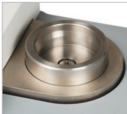
WT3003 Machinable blank terminal fixture

Secures ring terminations. Pin diameters from 1/8 to 3/8 in [3.2 to 9.5 mm].